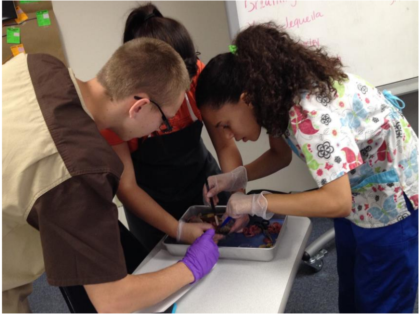
"I have direction now."