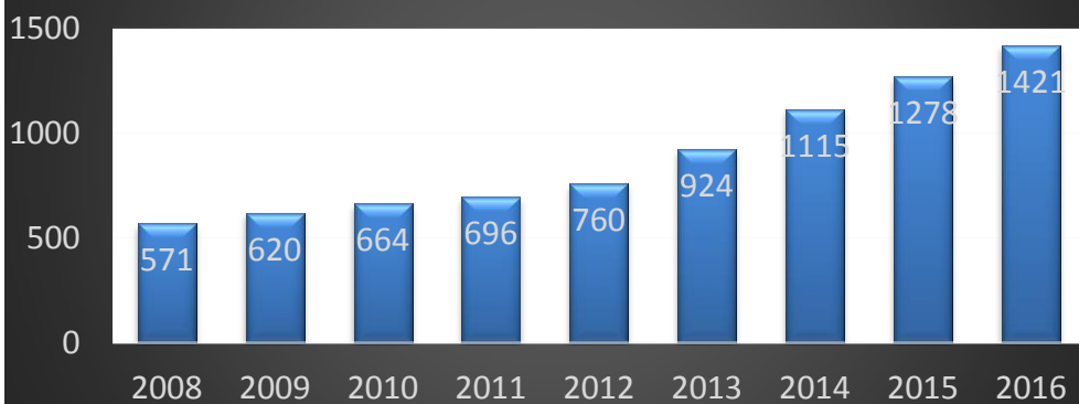
Number of APRNs Licensed in Nevada