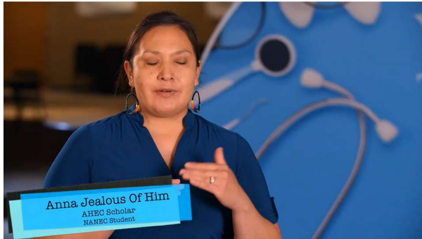
NANEK Student Story